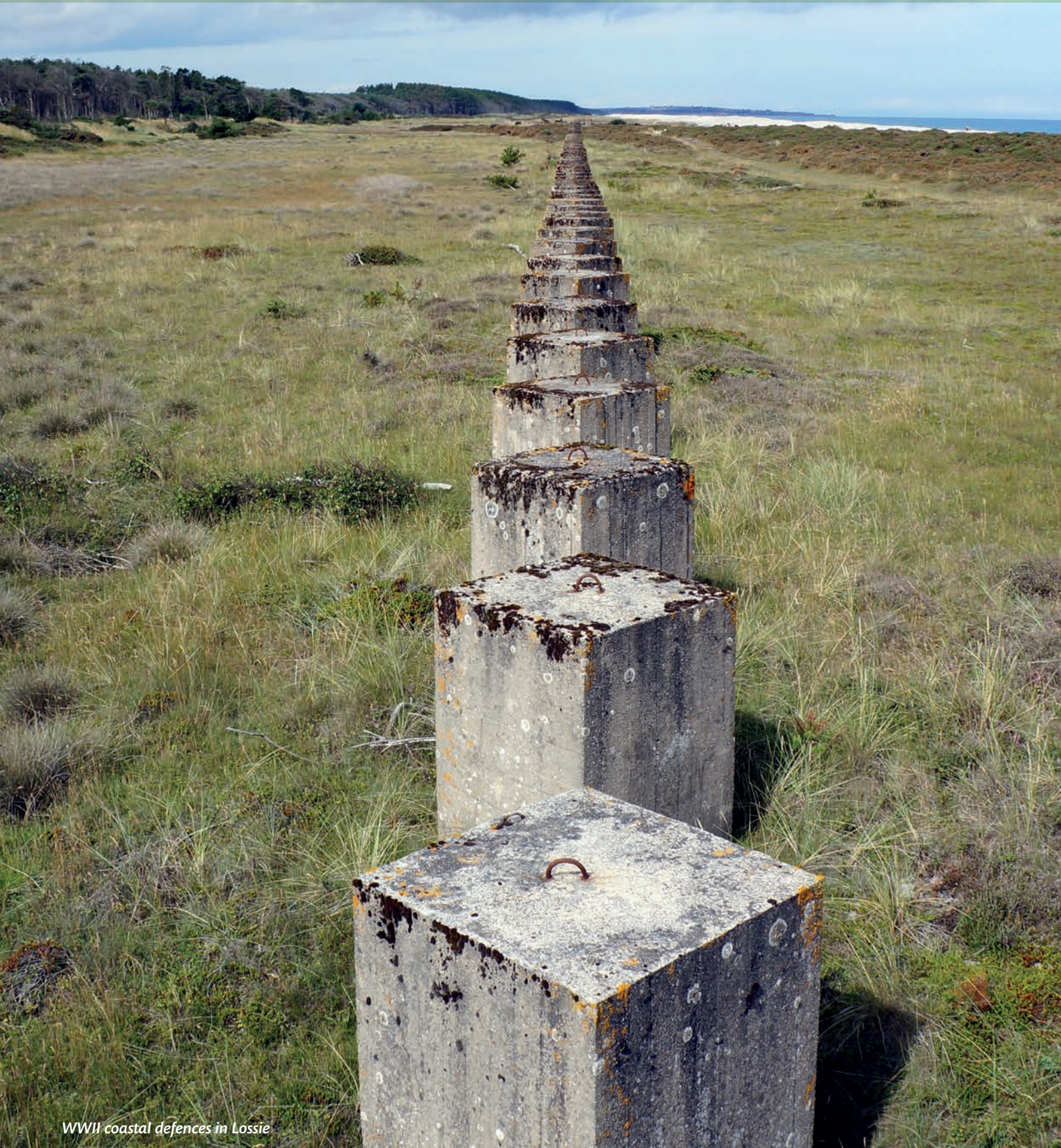
WWII coastal defences in Lossie