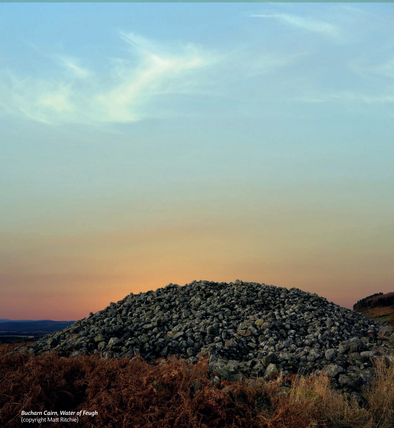
Bucharh Cairn, Water of Feugh