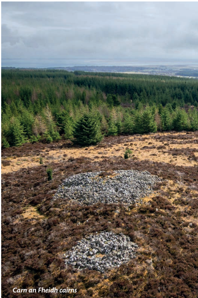
Carn an Fheidh cairns

Conservation Officers (often within Built Heritage Teams) provide local authorities with guidance to protect and enhance historic buildings and the built environment. They are normally based within the planning department. They report and advise on buildings and areas of special historic or architectural interest for their preservation, conservation, care and curatorship. They can guide development proposals to maintain the distinctive character of an area and can also be involved in regeneration projects that have community, economic and environmental benefits. The Conservation Officers are the appropriate initial point of contact for information on Listed Buildings and Conservation Areas.