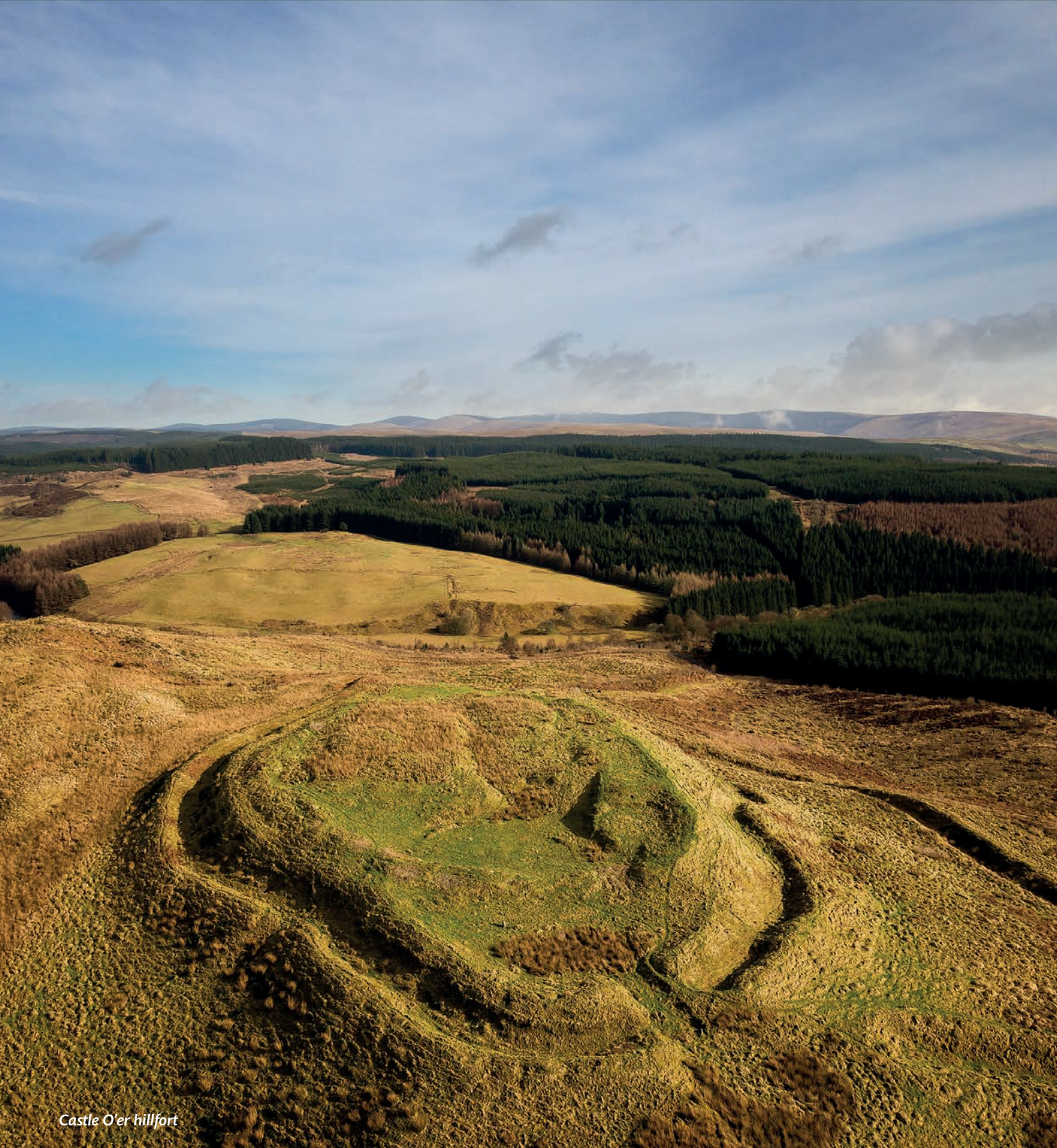
Castle O'er hillfort