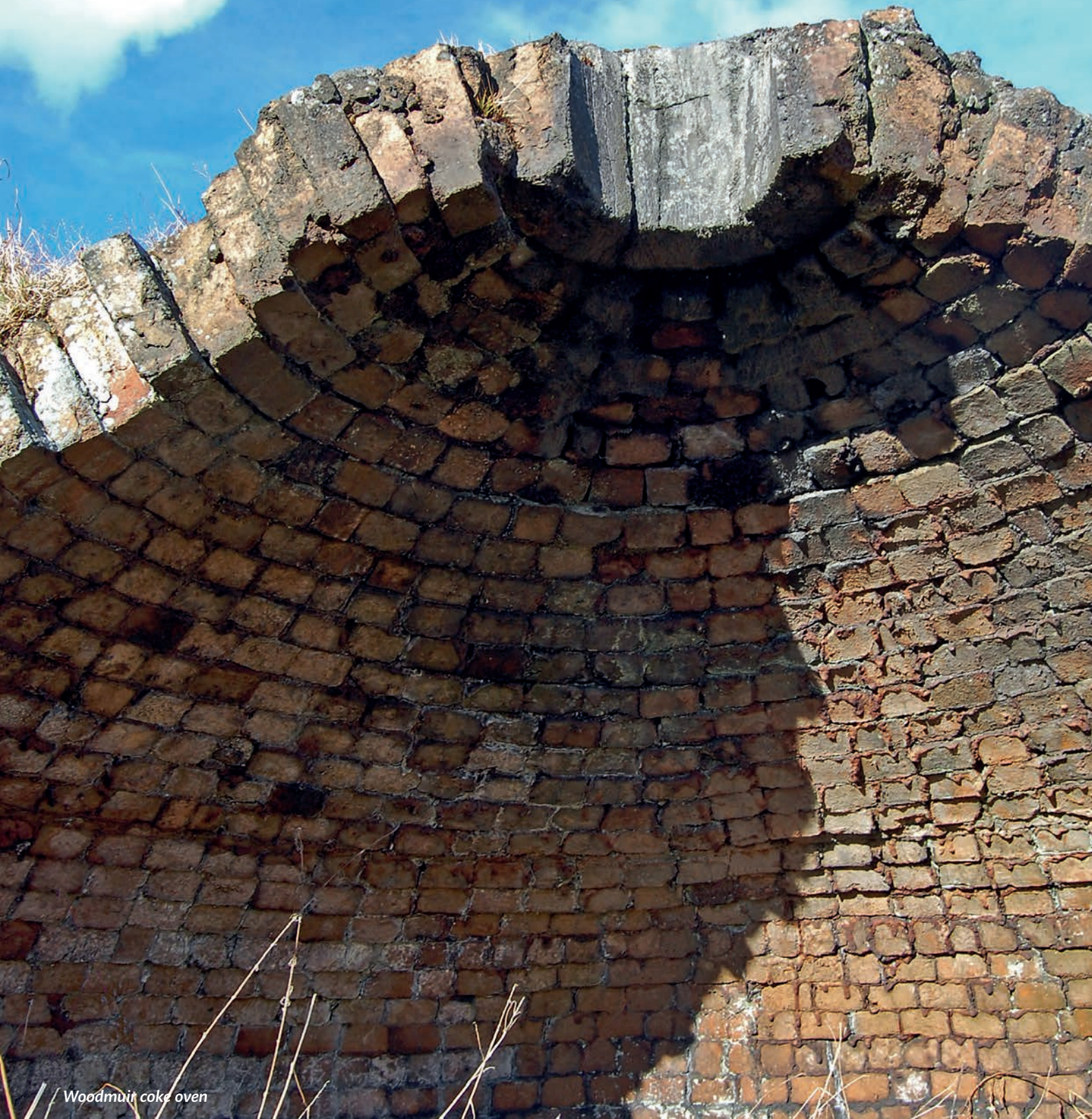
Woodmuir coke oven