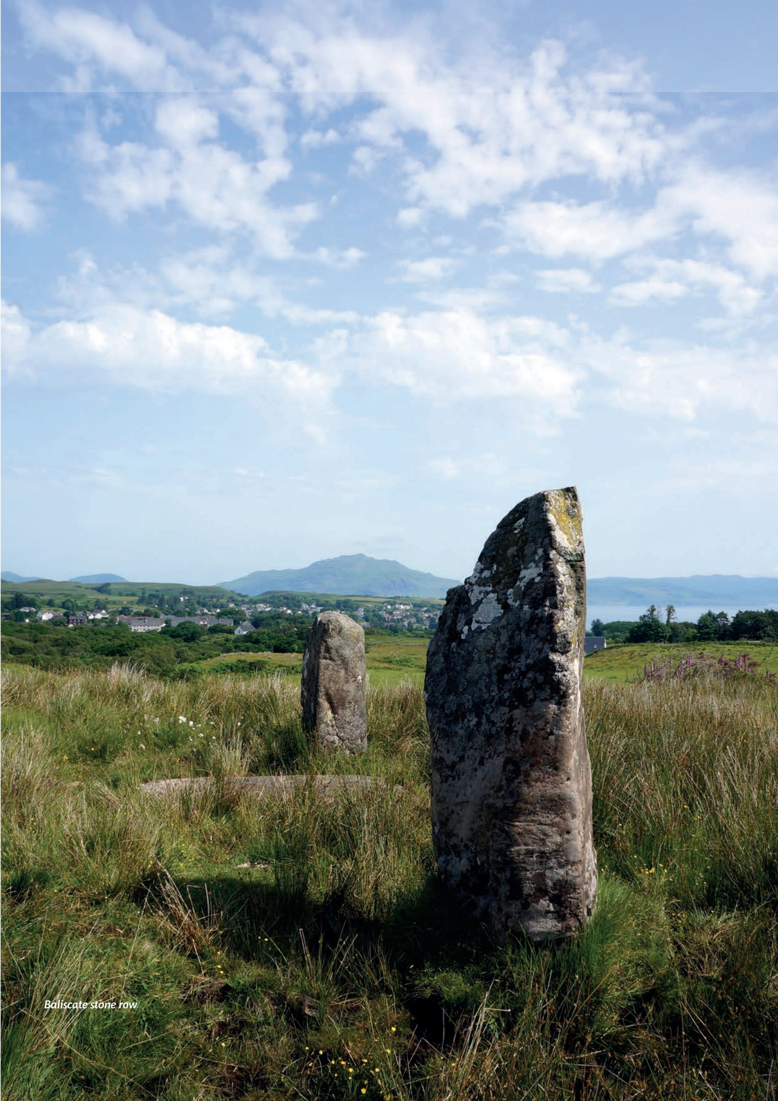
Baliscate stone row