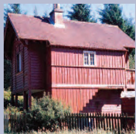
Swiss cottage near Fochabers, Moray, built around 1834 by the Duke of Gordon. Constructed of locally native Scots pine, the cottage is considered to be the oldest surviving timber framed and clad structure in Scotland.

Our concept of cultural heritage need not be constrained by age. 'Living culture', such as the performing arts or woodland sculpture, enhances visitor experiences as well as creating a link between communities and their local woodlands. This cultural engagement can help to develop familiarity with forestry, with woodlands becoming an even greater source of local pride and income. It can also contribute towards a renewed awareness, understanding, respect and care for them.