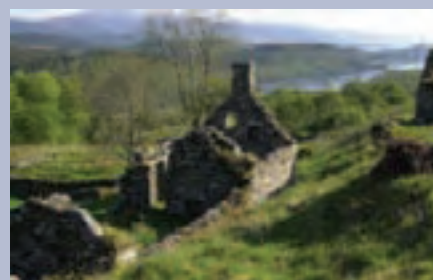
Abandoned early 19th century settlement of Arichonan, West Argyll

It is recognised that all Scotland's woodlands contain a diverse and rich collection of features of archaeological interest. Some of this cultural heritage is evidence of past woodland use and management. The woods and trees themselves though may also be recognised as essential elements of an historic and designed landscape.