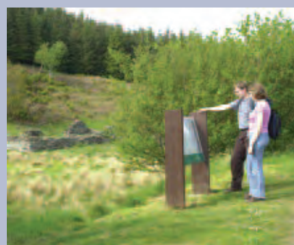
Kilmory Oib ruined village near Tayvallich, Argyll

Closely planted fast growing conifers altered the landscape context within which ancient funerary and ritual sites - such as chambered tombs, cup and ring mark rock art or stone circles - were originally intended to be set. As the trees matured and root systems developed, they could disturb buried archaeological features, deposits and artefacts.