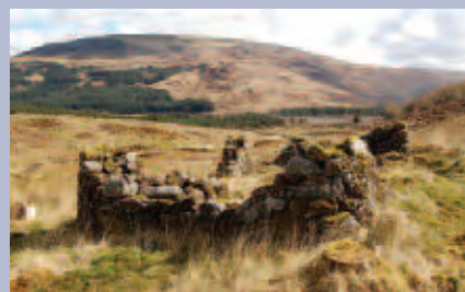
House remains at Aoineadh Mor settlement, cleared of inhabitants in 1824

Some types of features are typically associated with particular landscape settings. For example, saw pits and charcoal heaths are indicative of woodland environments, whereas burial mounds, hillforts and farmsteads would normally be expected to occur in more open landscapes. Beyond these features, entire hillsides, valleys, plains and similar regions can be reflective of past land-use within a certain area. They can be indicative of the local soil and geology, and therefore of agricultural or mining potential. These form part of the wider historic landscape and environment and should be taken into account when planning and managing woodland.