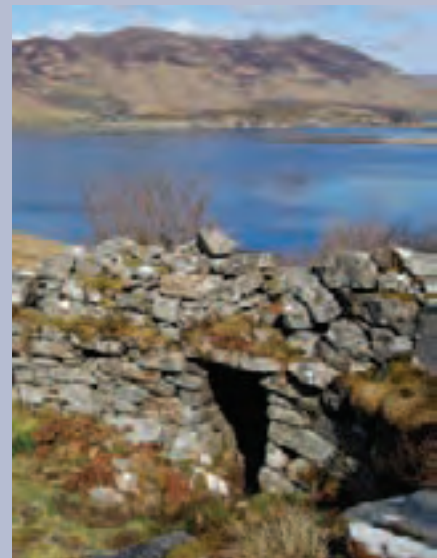
Casteall Grugaig Iron Age broch overlooking Loch Duich

From then until the 18th century, the combination of a gradual change in the weather pattern to one less favourable to tree growth, and the various demands placed on those woodlands by a growing and developing population, steadily reduced tree cover down to about 4% of land area.