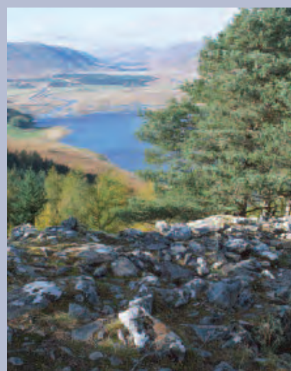
View from Dun-da-lamh, the prehistoric hill fort near Laggan, Badenoch, Highland

During the latter part of the 20th century the strategic timber resource imperative was gradually supplanted by the appreciation that all woodlands had the potential to provide multiple benefits. More recently, policies have been put in place to continue that steady expansion of woodland cover, and manage the resource for all the sustainable benefits it can provide for people, the economy and the environment.