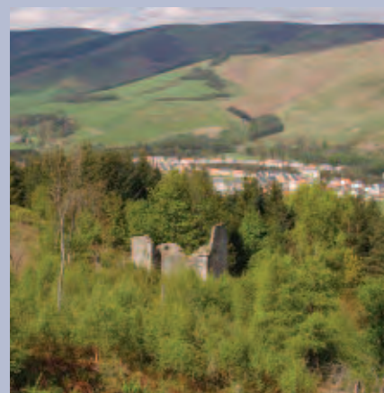
View over Cardrona Tower, seat of the Govan family in the 16th Century, looking towards Cardrona Village, Scottish Borders

Considerable improvements have been made in the way that the historic environment is protected in Scottish woodlands, but there has been less progress in active management to secure and enhance its condition for future generations. Good interpretation, coupled with creating an appropriate setting for features, can also enhance the recreational interest of woodland and help develop a better appreciation and understanding of the historic dimension and character of the present landscape.