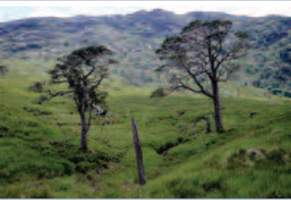
Caledonian pine forest remnants in excess of 450 years old, North Scotland

Woodlands were cleared mainly for farming and other land-uses. Others gradually disappeared under the pressures of human exploitation and animal grazing. When readily available, wood had many everyday uses, such as for dwelling and boat construction, and also for fuel. Although this renewable natural resource was valued and cared for, exploitation eventually reached the point where the woodlands could no longer renew themselves through natural regeneration.