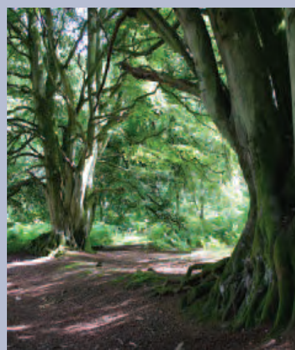
Veteran beech trees and boundary dyke to North Wood, Ballathie Estate, Perthshire

There is also scope to broaden the perception of the historic environment and cultural heritage. Historic routes (such as Roman roads and drove roads) and veteran, ancient or heritage trees (e.g. Perthshire Big Tree Country) attract considerable interest and can help to establish a link between people, places and woodland. The work of the famous plant collectors of previous centuries has continuing value for genetic conservation in other countries, and is also of special interest in terms of land use history.