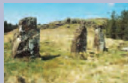
Standing stones in forest clearing near Dervaig, Isle of Mull, Argyll

Individual sites and features also form cohesive groups within the landscape and should be considered in their wider contexts. For example, ancient settlements and farmsteads are often surrounded and linked by field systems, routes and trackways.