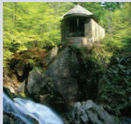
Ossian's Hall overlooking the Black Linn Falls on the River Braan